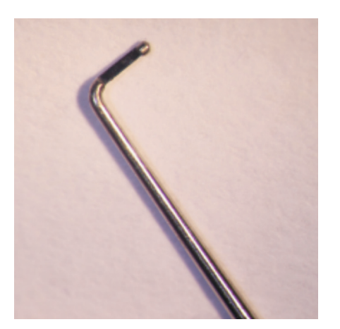
Figure 3 The Nagahara chopper applied for prechop and phacoemulsification.

Second, the tip of the capsulorhexis forceps is repositioned and inserted into the endonucleus inside the capsular rim at 11 o'clock (Figure 4B). The capsulorhexis forceps is pushed towards the center of lens, while the chopper is pulled down along the same radial meridian to give a counterforce.