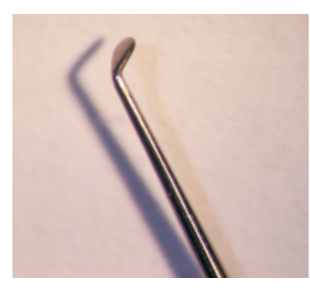
Figure 2 The O-shape chopper applied for prechop and phacoemulsification.