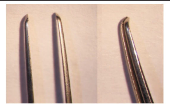
Figure 1 The capsulorhexis forceps applied for capsulorhexis and prechop.