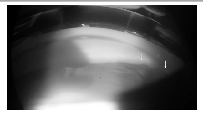
Figure 2 Gonioscopy image of peripheral anterior synechiae The PAS presented in a 70-year-old female patient 3mo after laser treatment. It has a wide base and inserts to the trabecular meshwork, extending along 2 clock hours (white arrows).

there was no evidence of a statistically significant change in the use of glaucoma topical medications after the procedure.