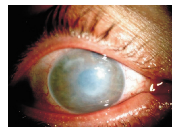
Figure 1 Patient 4, left eye.

After 3y later (42 years old) his visual acuity was perception in the right eye and 20/200 in the left eye. Slitlamp