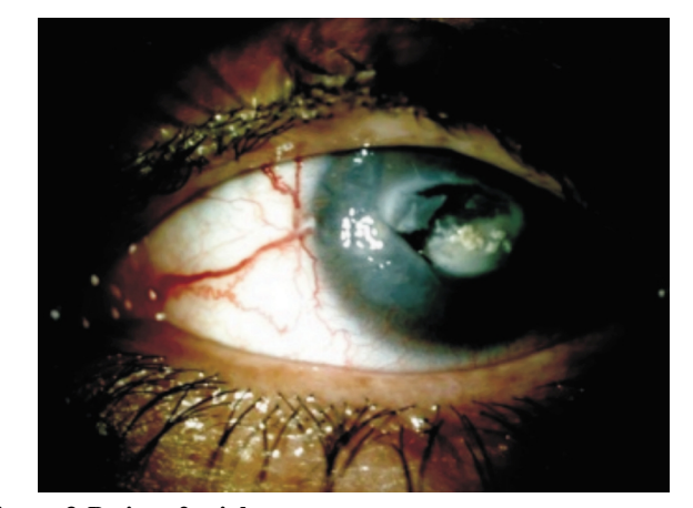
Figure 3 Patient 2, right eye.

examination was significant for corneal decompensation and the endothelial cell density was 770/mm<sup>2</sup> in the left eye. The right eye was preftisic with opaque and vascularized graft. The patient was scheduled for anterior chamber phakic IOL removal and penetrating keratoplasty. He refused surgery until his visual acuity decreased to the level of finger count. Surgery was performed under retrobulber anesthesia, pIOL was removed, cataratous lens was aspirated without need for phacoemulsification, foldable hydrophilic lens was implanted and PKP was performed without any complication. At last follow-up BCVA was perception in the right eye and 20/100 in the left eye.