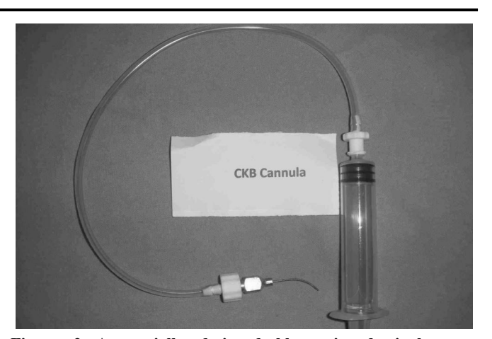
Figure 2 A specially designed blunt tipped single port (0.3 mm) silicon tubed cannula attached to a 5 mL syringe [Chandra Kanta Bhargava (CKB) cannula<sup>®</sup>].

AC was thoroughly washed with irrigating fluid and IOL was re-positioned. Paracentesis was hydrated at the end of procedure. The procedure time was recorded from side port entry to hydration of paracentesis.