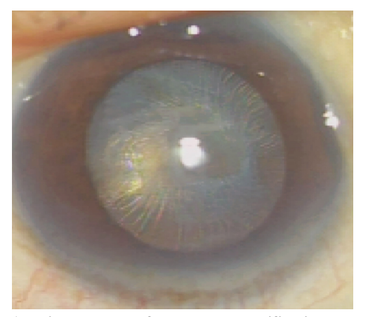
Figure 1 Five weeks after phacoemulsification and IOL implantation in the right eye