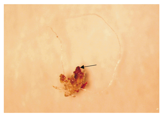
Figure 3 The protuberance removed was proved to be a crablike Phthirus pubis under high power lens. It was excreting the rusty granules (feces) from its abdomen (black arrow)

However, the Phthiriasis palpebrarum can easily be neglected because the crab louse often buries its semitransparent body deep into the lid margin. Furthermore, the translucent oval nits located into the bases of the eyelashes often confused with the crusty excretions of seborrheic blepharitis. So sometimes this disease will be misdiagnosed as common blepharitis.