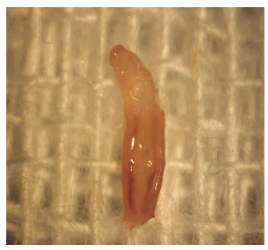
Figure 2 The worm was put on the medical gauze and checked under high power microscopy. The head sucker, midbody segments and tail sucker can be observed.

use of medicinal leeches has lasted for over 2500 years [1,2]. They play a useful role in modern plastic surgery, transplant surgery, cardiovascular and cerebrovascular disease because of their superb decongestant properties.