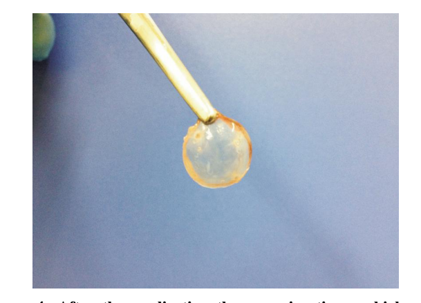
Figure 4 After the application the excessive tissue which was extended beyond the CL was cut with a scalpel.

Mitotic division of the basal cell layer of the corneal epithelium is normally renewed in 7-10d on a regular basis. Epithelial cells on the surface shed to precorneal tear film. The basal layer cells are constantly replaced by multiplying the cells. Corneal wound healing takes place in three stages these are: migration of healthy epithelial cells to this area,