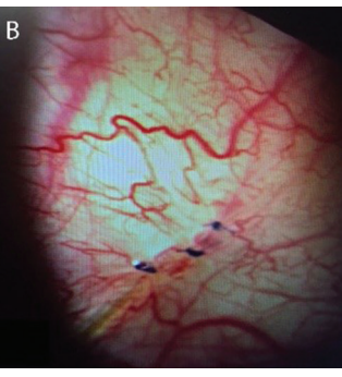
Figure 1 Color images of XEN45 Gel Stent exposure in ×10 magnification A: Complete transconjunctival stent erosion, only resistance to aqueous outflow remaining within the microstent. Slit-lamp photograph showing fluorescein dye with cobalt blue filter. Aqueous leakage clearly visible on the right hand side of the stent. B: Following suturing of conjunctiva.