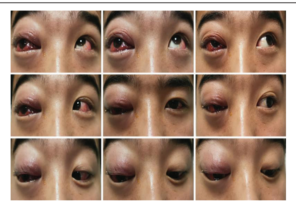
Figure 1 External photograph demonstrated the marked right eyelid swelling, the limited extraocular motility of the right eye on 6d after strabismus surgery.