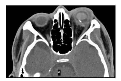
Figure 2 Case 2 A hyperdense shadow of the metallic fragment located in the eye.

Case 3 A 30-year-old male worker presented with vision loss in his left eye for 3h after hammering concrete in a construction site (Table 1). His VA of the left eye was HM before the eye. There was a scleral wound of 5 mm at 7 o'clock, 5 mm posterior to the limbus, with vitreous prolapse. The lens was opacified. The fundus couldn't be seen clearly because of VH. The orbital CT displayed that there was a metallic FB (6 \times 3 \text{ mm}^2) in the left eye supratemporal, with the CT value of 2963 Hu (Figure 3A). The surgery was performed on the first day of admission. Multiple 7-0 Vicryl interrupted sutures were used to close the scleral laceration. PPV was performed. A retinochoroidal break corresponding to the scleral wound was obvious, while another retinal break was found, about 2 DD supratemporal to the fovea, with localized retinal edema, hemorrhage, and mild RD, but no choroidal break was seen in the corresponding site. An oval choroidal elevation was noticed, which was about 4 DD supratemporal to the retinal break. No obvious FB was found in the vitreous cavity or subretinal space. The operation was stopped. Silicone oil was used as tamponade.