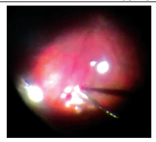
Figure 3 Improved retinal view through a multifocal IOL under air, using a wide-field contact lens, after coating the IOL anteriorly and the posterior capsule posteriorly with Healon, and slightly tilting the contact lens.

Visualization during a standard PPV under air is more challenging compared to PPV under water, because the