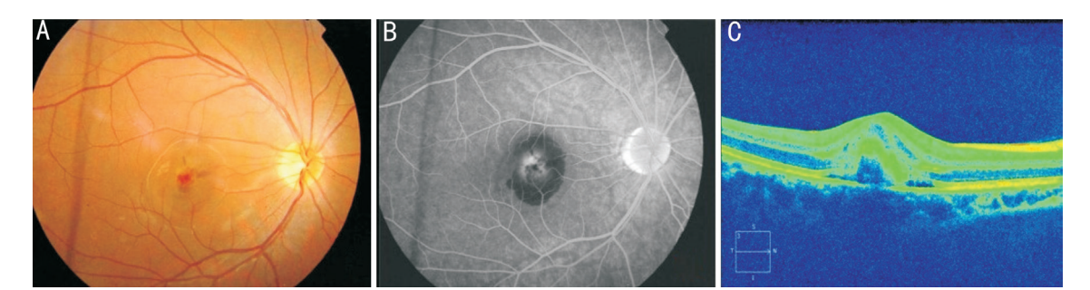
Figure 1 Ten days after laser irradiation of the right eye A: Fundus examination revealed subretinal hemorrhage and exudative lesions in the macular area, with peripheral retinal edema; B: FFA suggested hyperfluorescence lesion in the fovea, surrounded by low fluorescence; C: OCT showed hyperreflective subfovea lesion with a small neuroepithelial detachment.